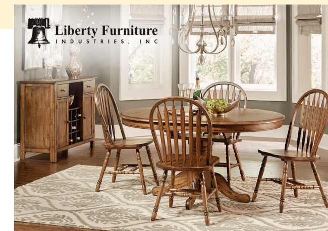
5 PC DINING SET $899 99