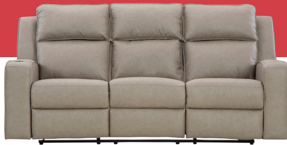
ASHLEY FURNITURE INDUSTRIES, INC. RECLINING SOFA $899 99