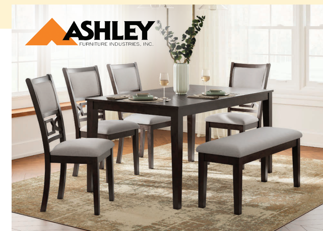
6 PC DINING SET $649 99