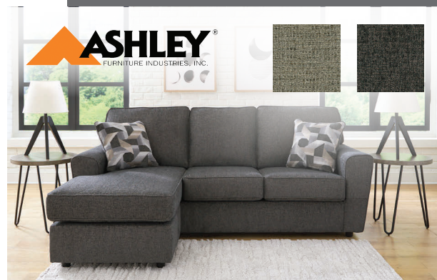
SOFA CHAISE $599 99