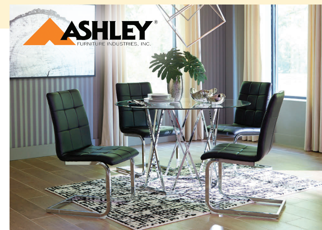
5 PC DINING SET $599 99