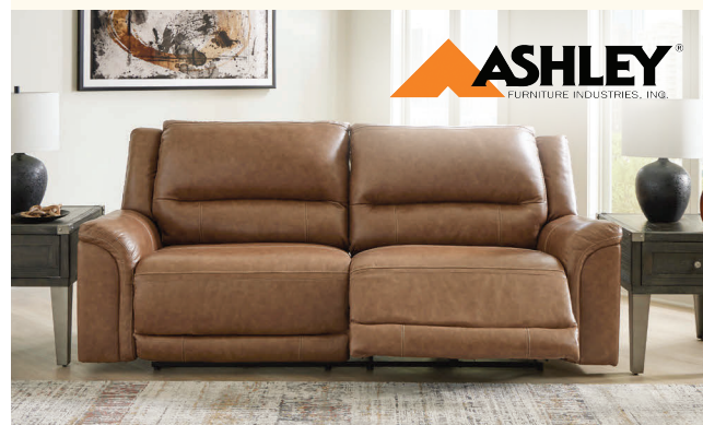
POWER LEATHER RECLINING SOFA $1599 99