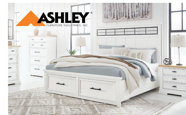
QUEEN PANEL STORAGE BED $649 99