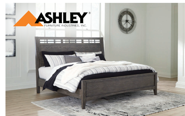
QUEEN PANEL BED $499 99