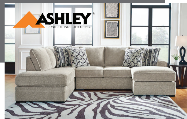
2 PC SECTIONAL $1399 99