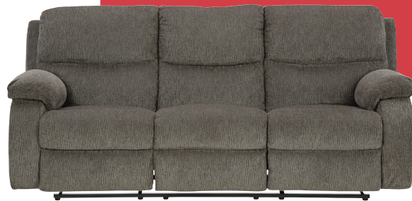
ASHLEY FURNITURE INDUSTRIES, INC. RECLINING SOFA $699 99