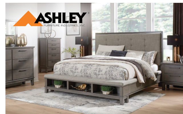
QUEEN STORAGE BED $799 99