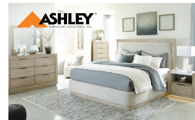
QUEEN PANEL BED $799 99