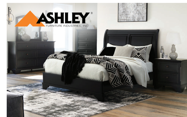
QUEEN SLEIGH BED $499 99