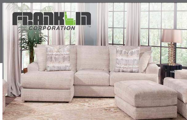
SOFA CHAISE $999 99