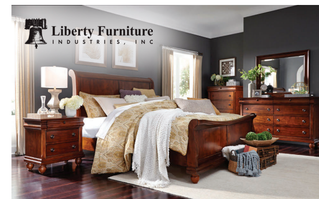
QUEEN SLEIGH BED $799 99