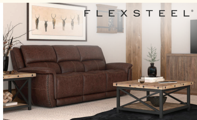
POWER RECLINING SOFA $1799 99