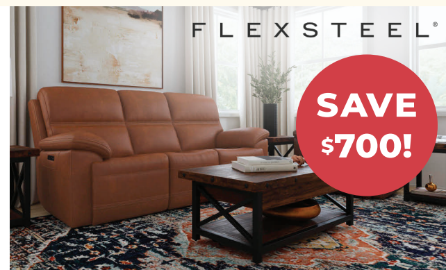
POWER LEATHER RECLINING SOFA $2199 99