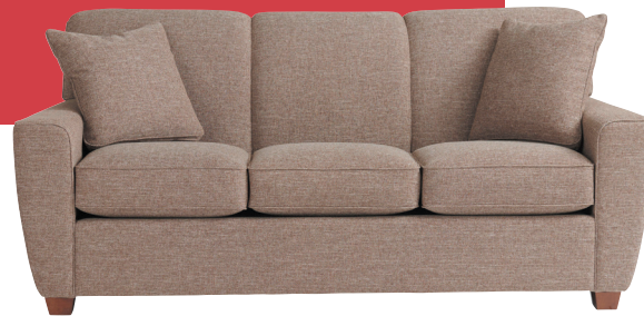
LA Z BOY SOFA $999 99